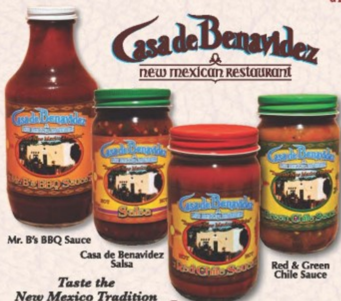
Mr. B's BBQ Sauce